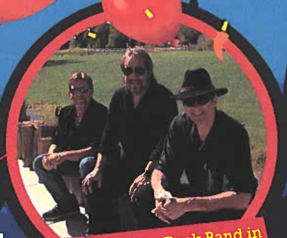
The favorite Rock Band in Amargosa and Pahrump.